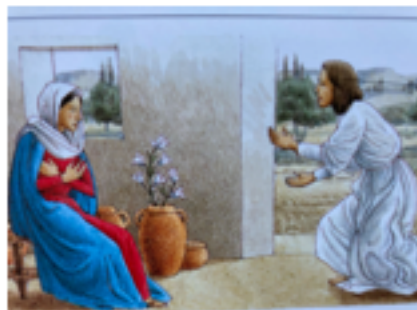
An angel visits Mary

God sent an angel to tell Mary that she would give birth to a baby boy. His name would be Jesus and he would be the saviour of the world. Mary became pregnant by God's miraculous power.